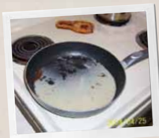
Let bacon grease and other fats harden.