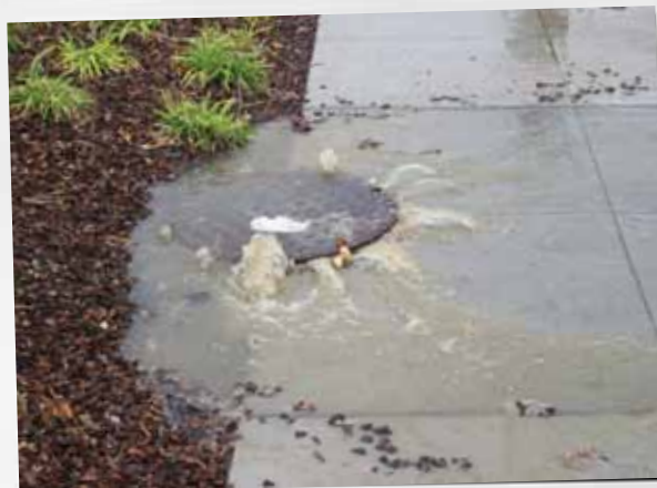
sewer overflow due to infiltration

If you see an overflowing sewer manhole cover like this, please notify us immediately!