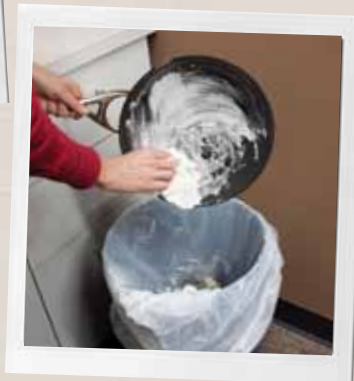
Wipe the grease off with paper towels and discard the towels in the trash or food scrap bin.