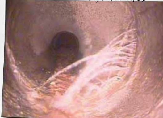
through cracks and loose connections