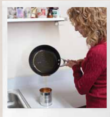
Pour grease into a can and when full, toss the jar into the trash.