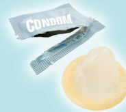
Condoms & their Wrappers