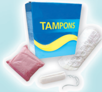
Tampons, Applicators, & Pads