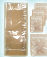
Cellophane Wrapping & Plastic Bags