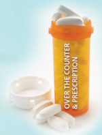
Prescription & OTC Medications