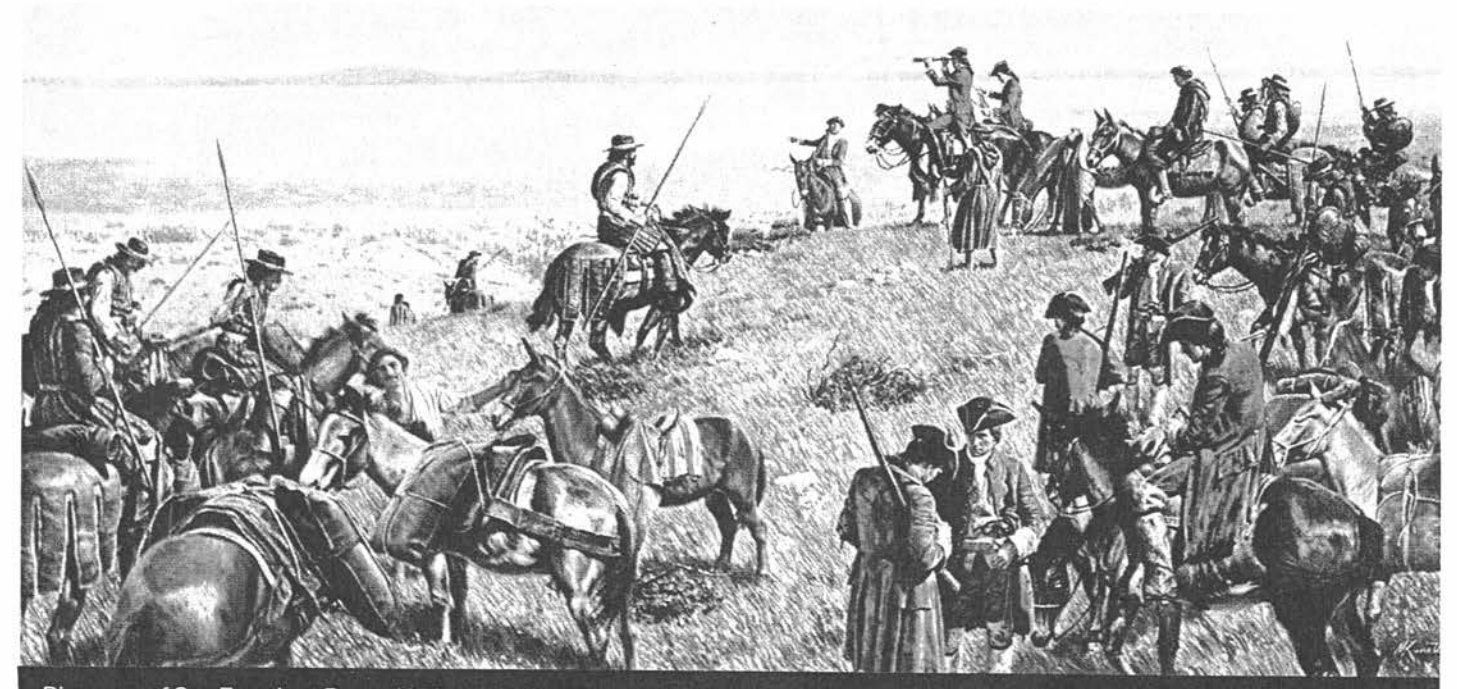
Discovery of San Francisco Bay, a 1971 painting by Morton Künstler, is on exhibit at the San Mateo County History Museum. Don Gaspar de Portolá is depicted viewing the San Francisco Bay from Sweeney Ridge on November 4, 1769.