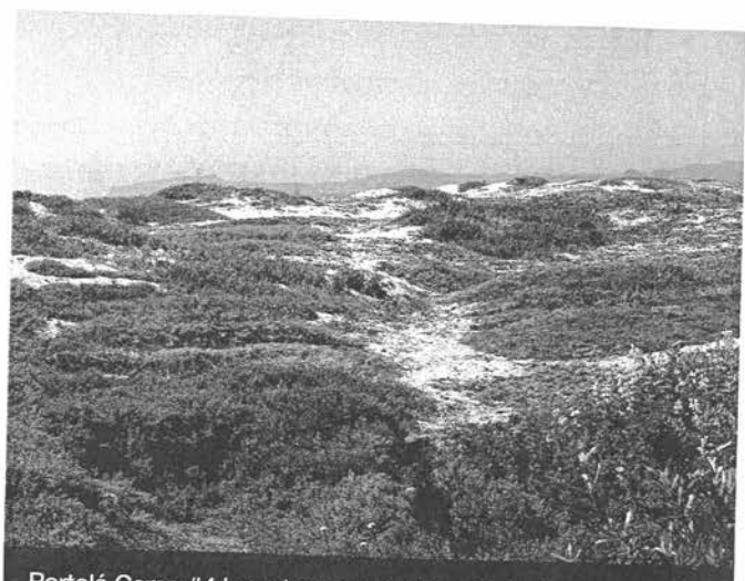
Portolá Camp #4 has changed significantly from Portola's time. In 1769, the various creeks flowing into the Pacific were open to the sea and required bridging before the expedition could pass.

* Is there evidence of established public jurisdictions dealing with land protection and outdoor recreation to insure future improvements, to control and support usage, and to provide maintenance over the route?