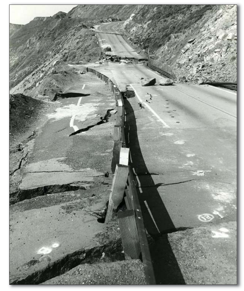
1953 slide.

Since the late 19th century, engineers have waged war against the Devil's Slide formation. The first County road was abandoned in 1914, due to rock falls, and replaced with a winding bypass route to the east over San Pedro Mountain. In 1906, the Ocean Shore Railroad between San Francisco and Santa Cruz was under construction when the Great San Francisco Earthquake caused the Devil's Slide section to plunge into the ocean. Following in the shadow of these