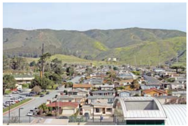
San Mateo County, cities and environmentalists are seeking to designate San Bruno Mountain as a priority for conservation.

If San Bruno Mountain, the Bay Area's largest urban open