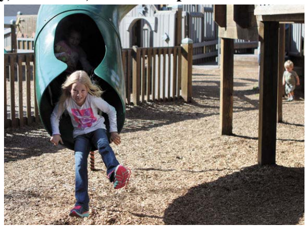
Moss Beach Park is changiong

The renovation comes not long after Moss Beach Park was nearly sold at auction to a private developer. The