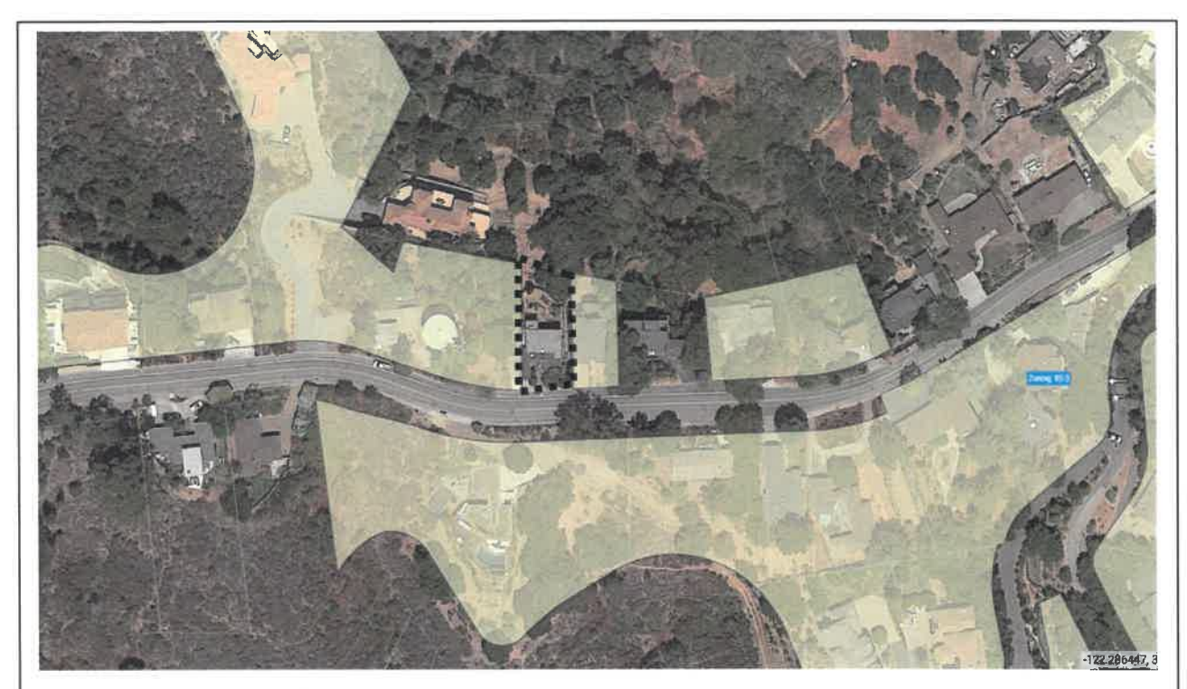
......General Plan Map Amendment, Land Use Designation: Single Family, Low Density (3 DU/AC)