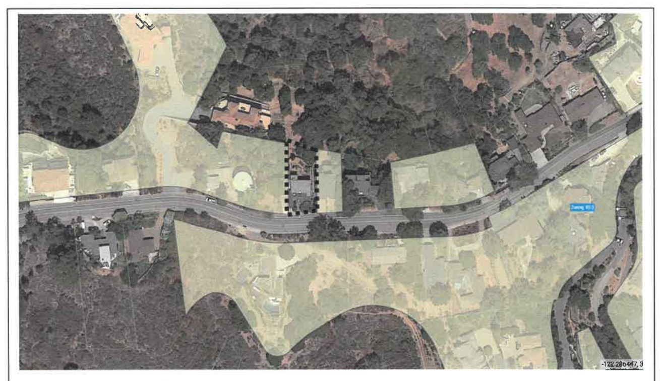
•••••••General Plan Map Amendment, Land Use Designation: Single Family, Low Density (3 DU/AC)