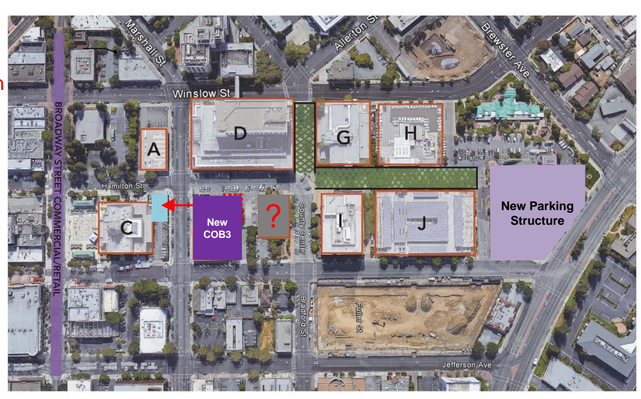
Site Plan – Existing Condition