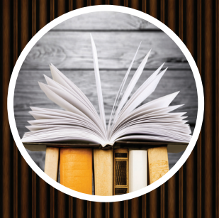
Building Brands that Tell Stories

Solving Communications Challenges with Strategic Thinking