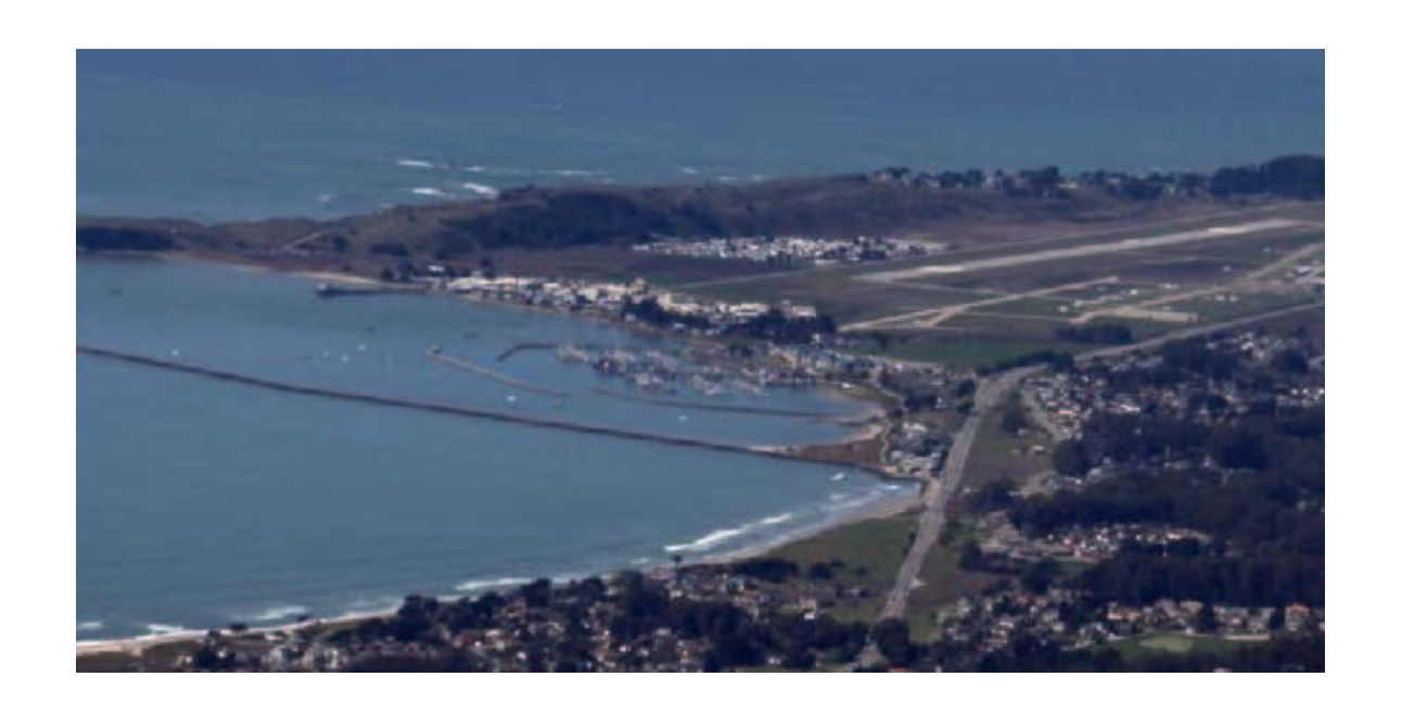
July 31, 2007