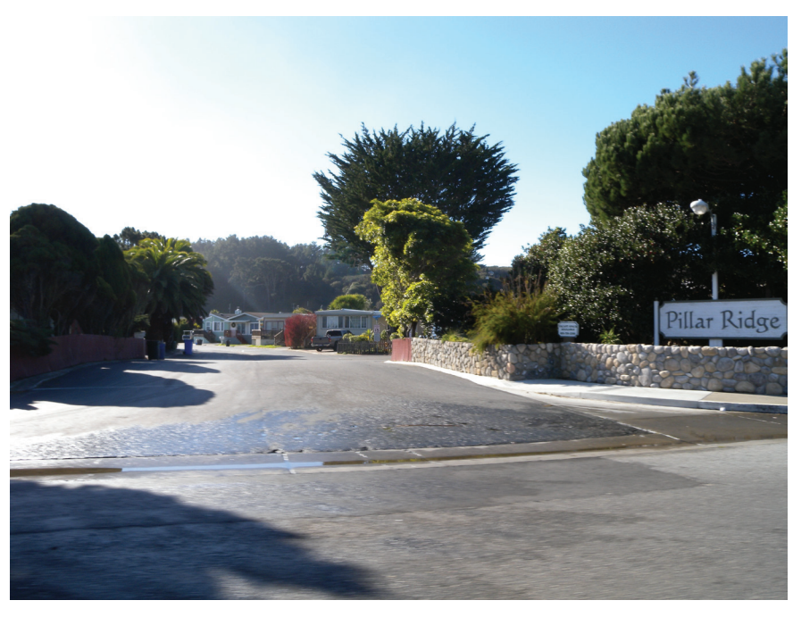
Manufactured housing community