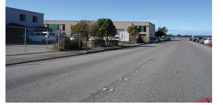
Research and development