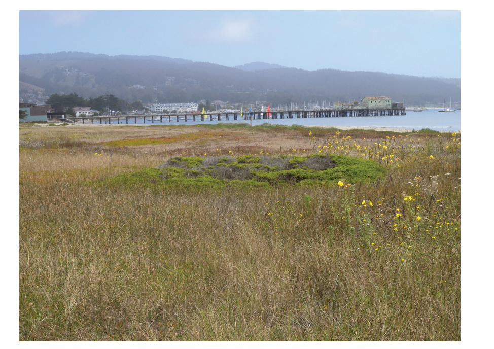
Pillar Point Marsh