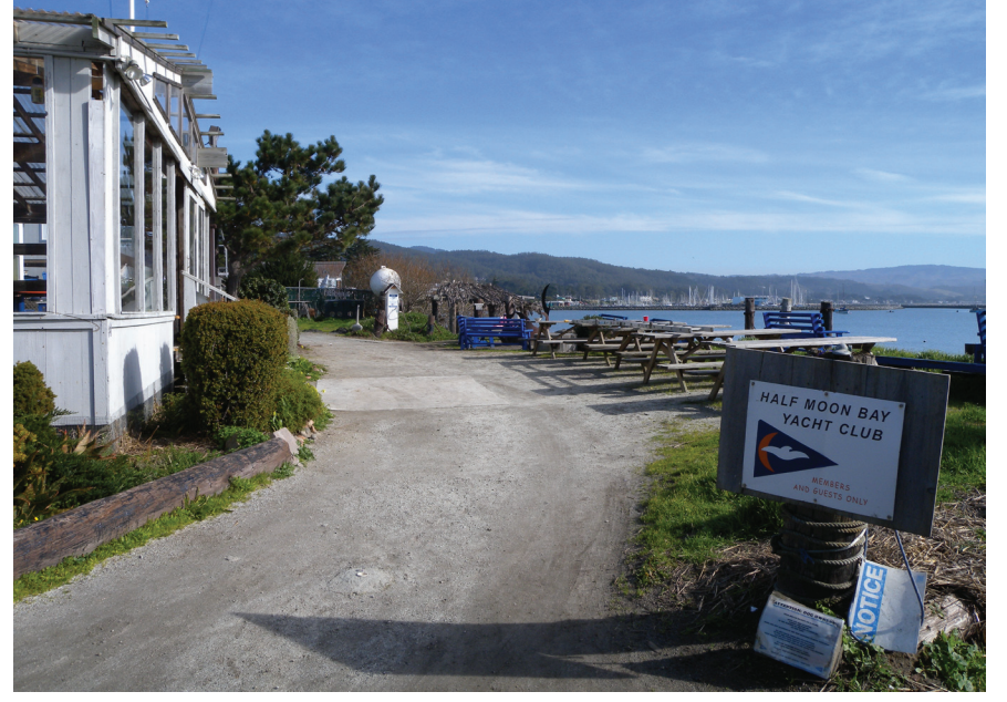
Marine-related clubs and institutions