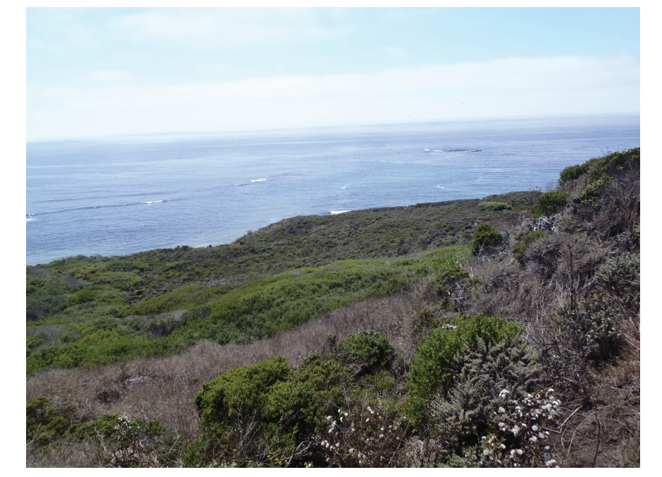
Pillar Point Bluff