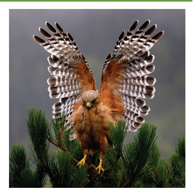
Red-shouldered hawks are frequently seen throughout Wunderlich Park.

When you're done with your tour, please return this guide to the klosk for the next visitor. If you find this guide, please return it to: Wunderlich Park, 4040 Woodside Road, Woodside, CA, 94062.