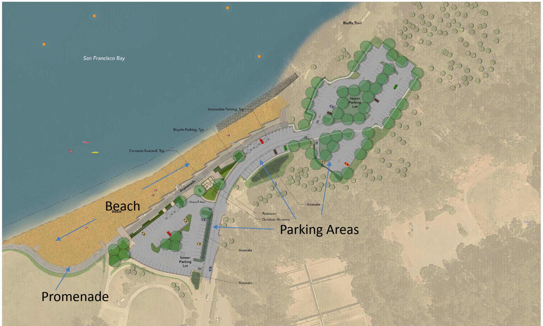
Coyote Point Eastern Promenade - Site Plan