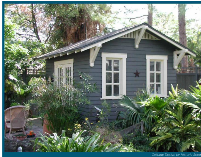
Cottage Design by Historic Sheds