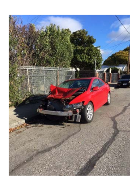
Subject to SMC Code Section 7.60 Abandoned vehicles