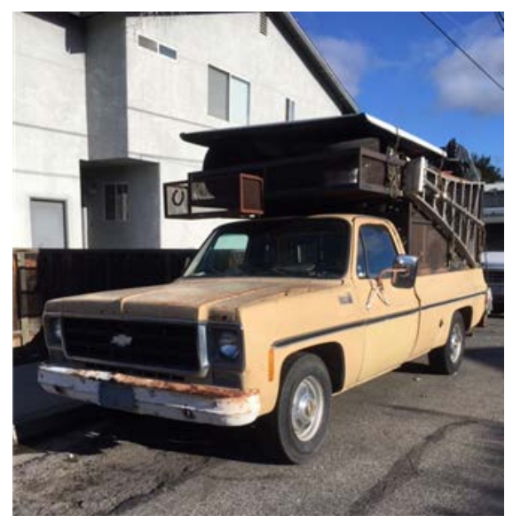
May be prohibited if over 6 ft high