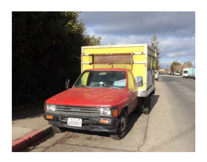
May be prohibited if over 6 ft high