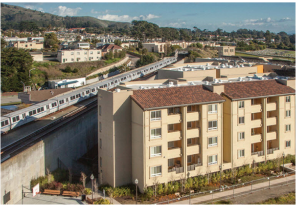
Housing near transportation in Northern San Mateo County

Home for All SMC is a collaborative initiative comprised of the County of San Mateo, various cities/towns, school districts, community-based organizations, advocacy groups and businesses. The mission of Home for All is to establish a climate in San Mateo County where a diversity of housing is produced and preserved so that San Mateo County will be a culturally, generationally, and economically diverse community with housing for all. It is administratively supported and funded by the County of San Mateo.