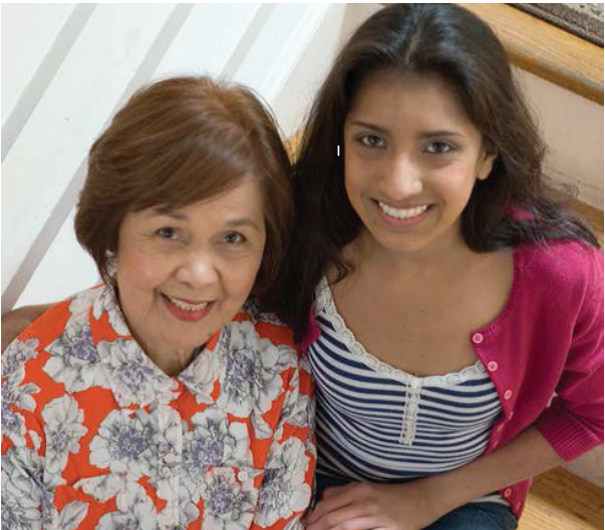
Home Sharing Participants in San Mateo County