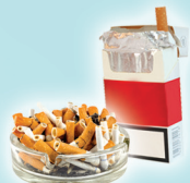
Cigarette Butts & Cigarette Wrappings