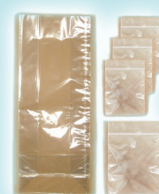
Cellophane Wrapping & Plastic Bags