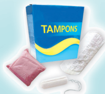
Tampons, Applicators, & Pads