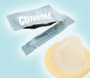
Condoms & their Wrappers