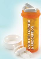
Prescription & OTC Medications