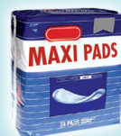
Maxi Pads & their Wrappers