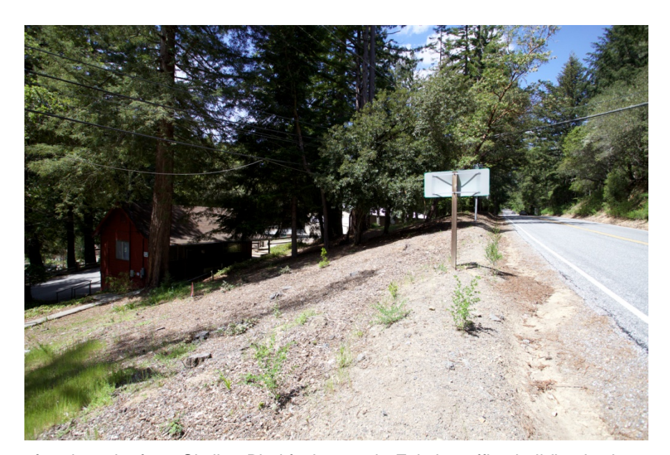
Photograph 18: View of project site from Skyline Blvd facing north. Existing office building is shown tucked up against the hillside and shaded by mature redwood trees.