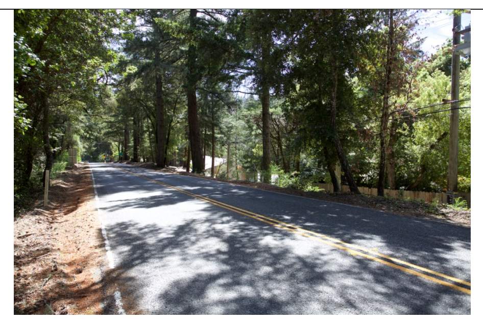
Photograph 15: View from Skyline Boulevard looking south towards the apparatus building (roof visible through trees).