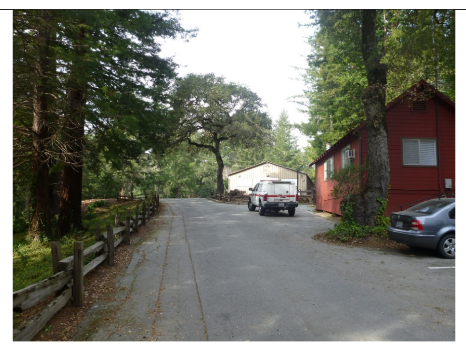
Photograph 5: Looking north into the site towards the apparatus building in the distance. A parking area and the administrative building are visible on the right in the photo.