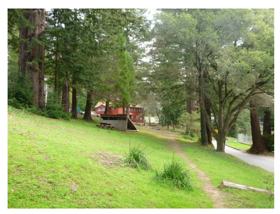
Photograph 14: View south from bottom of the hillside below the paved area looking along the western edge of the project site. Blakewood Way and the Skylonda Mutual Water Company Reservoir are visible in the right of the photo.