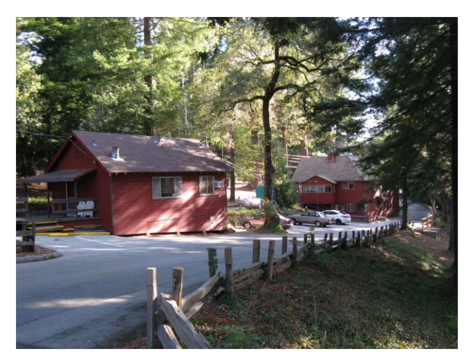
Photograph 8: Administrative buildings from middle of project site. The closer building is the office and the more distant building is the barracks.