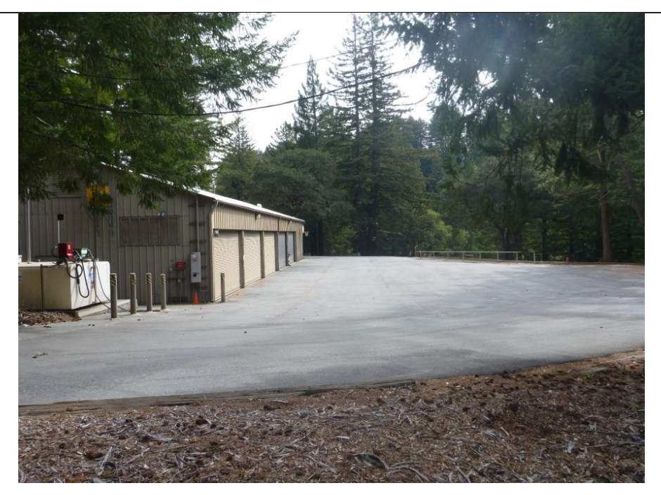
Photograph 9: Apparatus building and paved area from Linwood Way facing south.