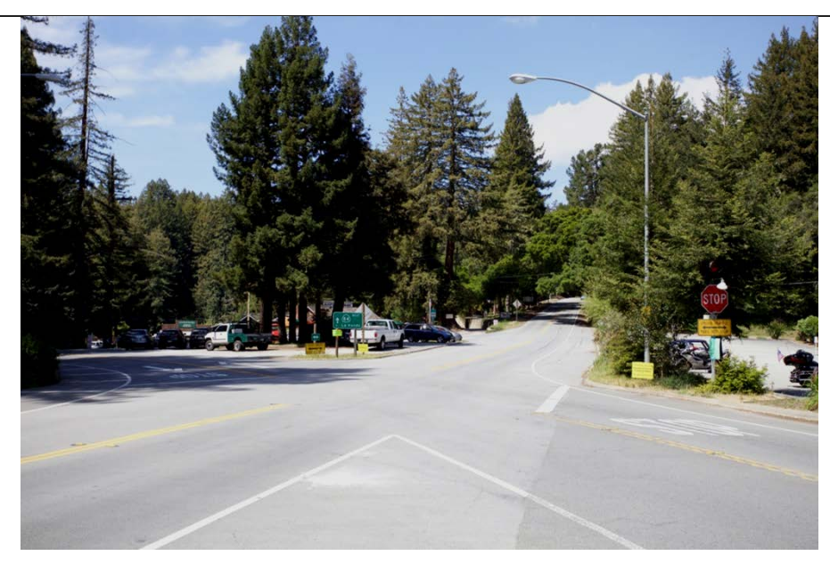
Photograph 1: Intersection of Skyline Boulevard and La Honda Road looking northwest towards Alice's Restaurant and the project site. Other than the ingress/egress to the site, site features are not clearly visible from this location.