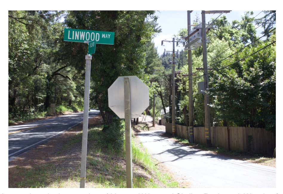
Photograph 12: Facing south at the intersection of Linwood Way and Skyline Boulevard. Wooden fencing along Linwood Way is visible behind the telephone poles.