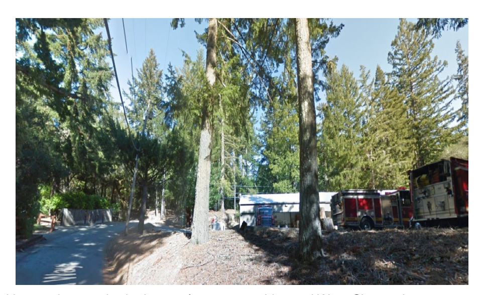
Photograph 20: Looking north towards site ingress/egress onto Linwood Way. Sign and pavement markings indicate the emergency vehicle exit route.