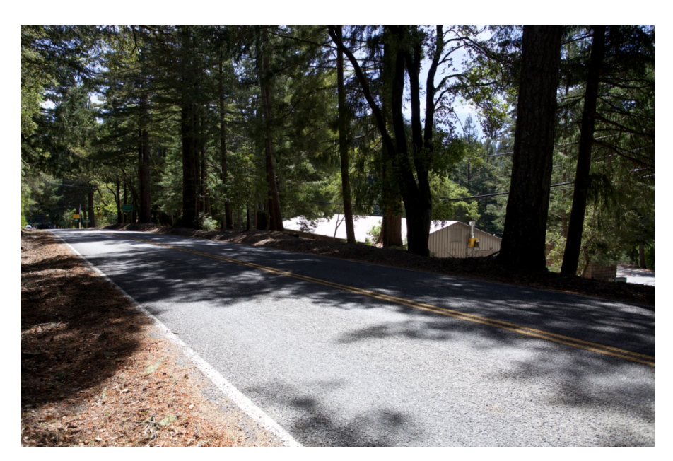
Photograph 16: View of apparatus building roof from Skyline Boulevard (looking south/southwest). The new driveway entrance would be past the apparatus building.