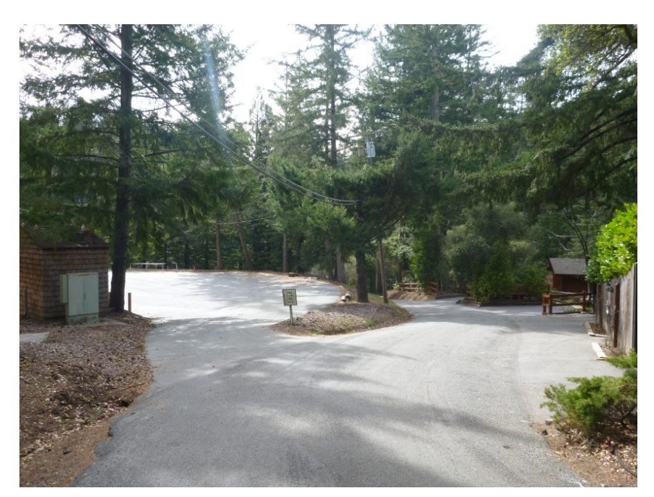
Photograph 10: View of Skylonda Fire Station ingress/egress onto Linwood Way. Site egress is on the left and Linwood Way curves behind the site to the left and merges into Blakewood Way. Two residences on Linwood Drive are directly across from the fire station property and have views of the apparatus building and pavement area.