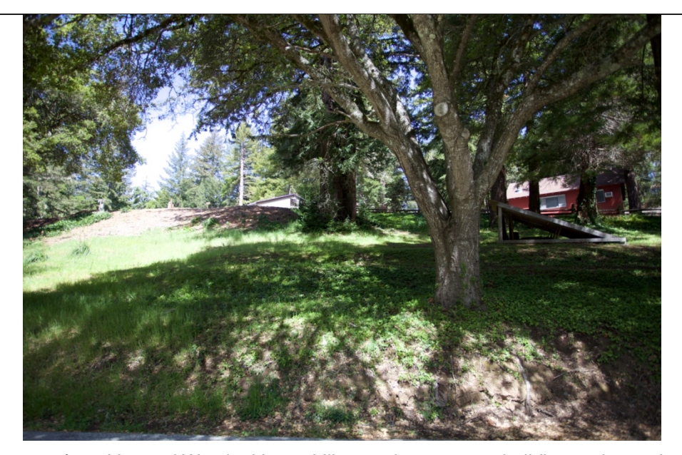
Photograph 13: View east from Linwood Way looking uphill towards apparatus building and paved area. The new firehouse building would be located at top of slope near center of photo.