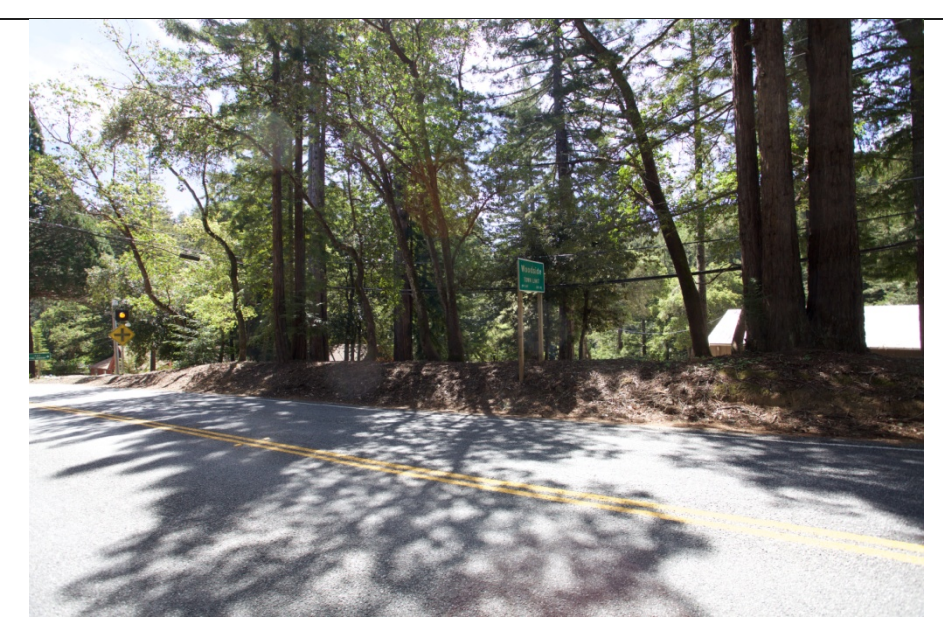
Photograph 17: View of project frontage from Skyline Boulevard (looking west). This photo shows the general location of the proposed new driveway connection to Skyline Boulevard.