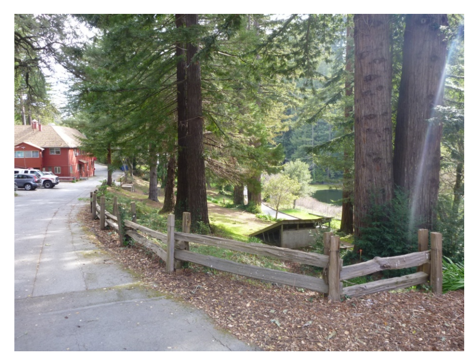
Photograph 6: Middle of project site facing south at the edge of the pavement. Reservoir below project site is visible between the trees. Existing barracks is behind the parked cars.