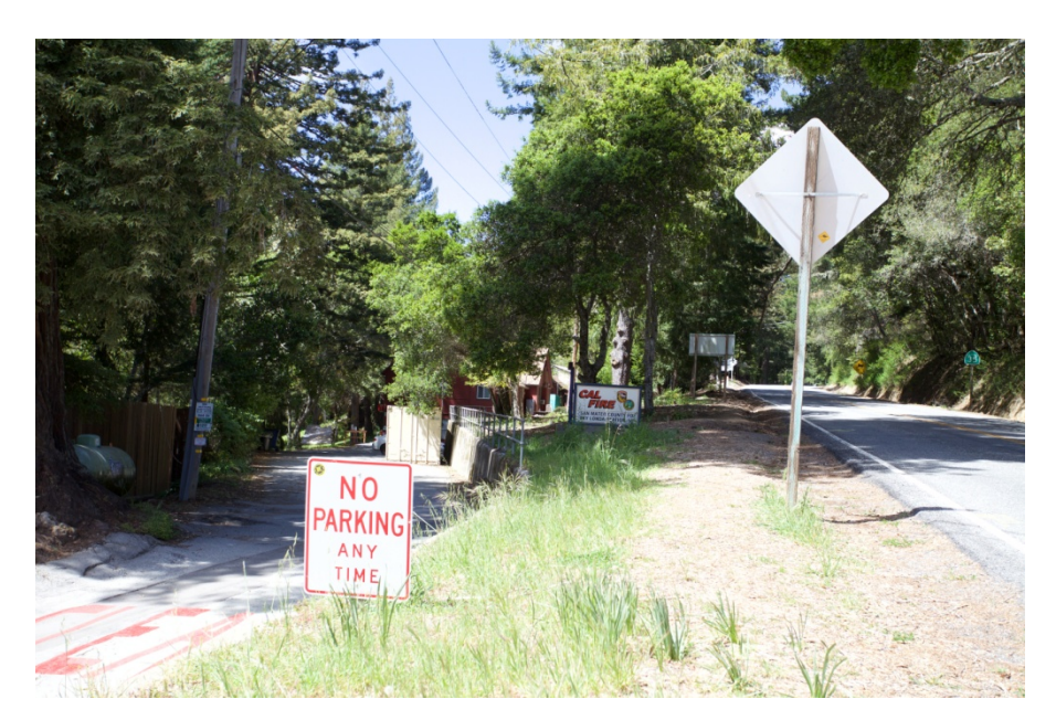
Photograph 4: Looking north from Skyline Boulevard towards the site ingress/egress right-of-way by Alice's Restaurant and into the project site.