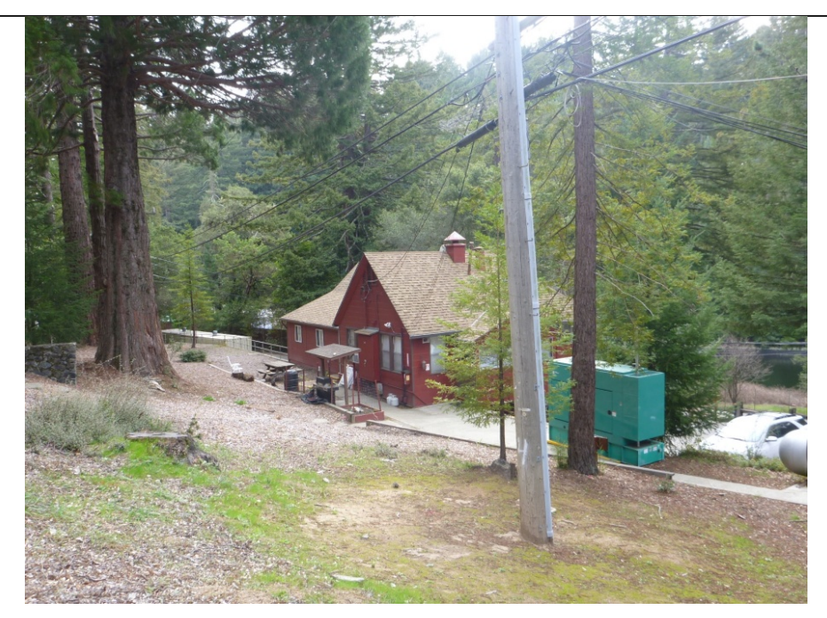
Photograph 7: Back of administrative buildings from Skyline Boulevard.