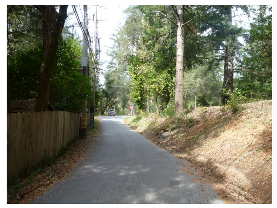
Photograph 11: Looking east up Linwood Way towards Skyline Boulevard from site egress near apparatus building.