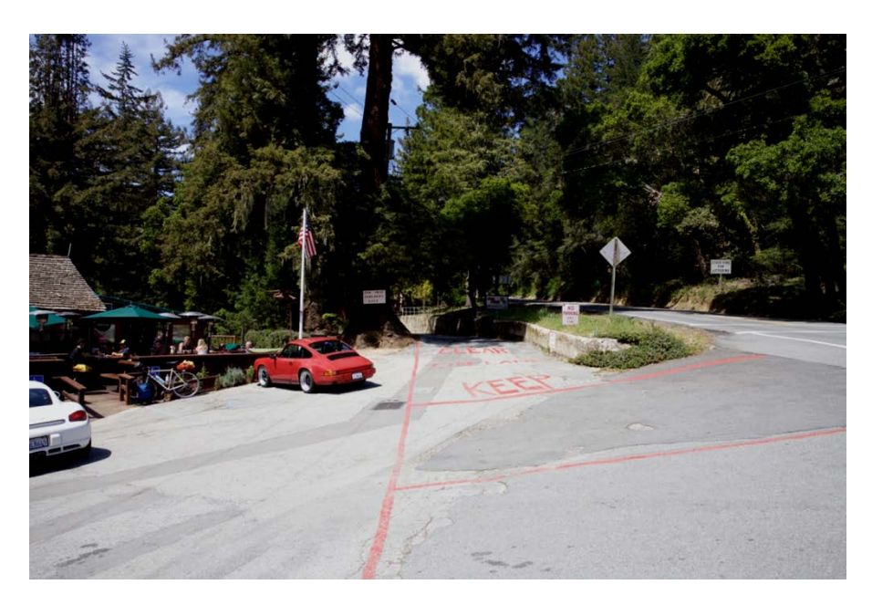
Photograph 2: Looking north towards site ingress/egress onto Skyline Boulevard through the right-of-way next to Alice's Restaurant parking lot. Sign and pavement markings indicate the emergency vehicle exit route.