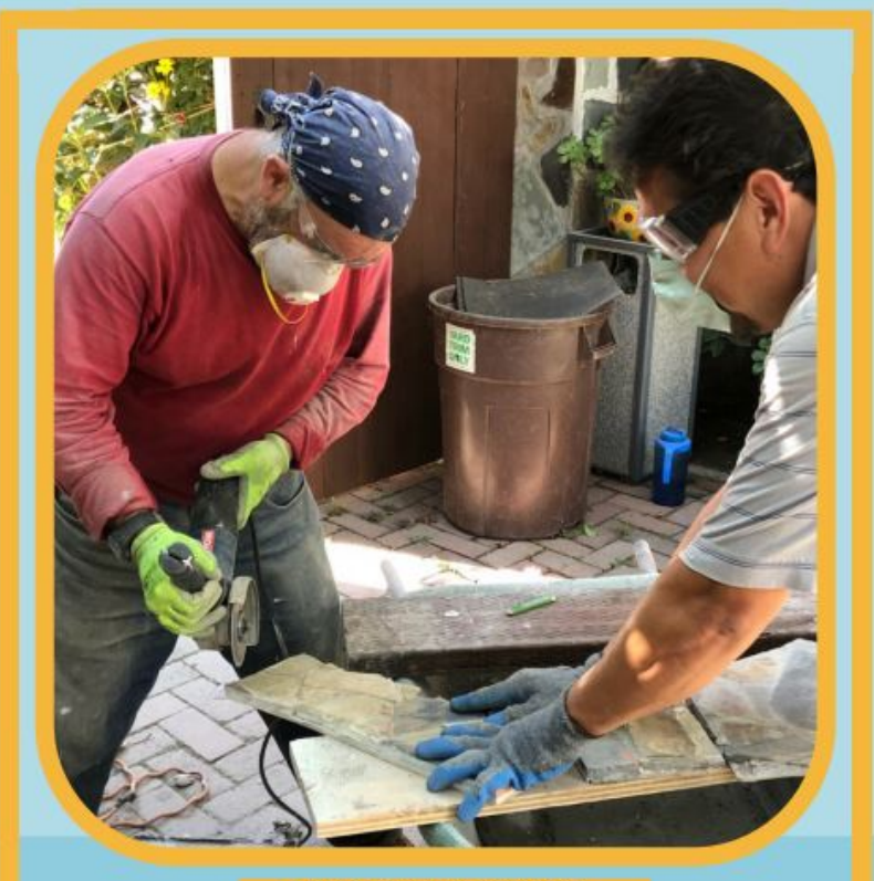
Day Laborers at work. Hire a worker today!