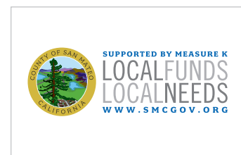
5 x 8 in. Decal