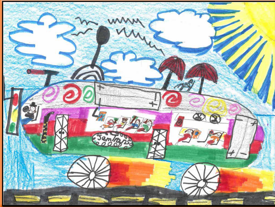
Emilia Lee, 1 st Grade Central Elementary, Belmont