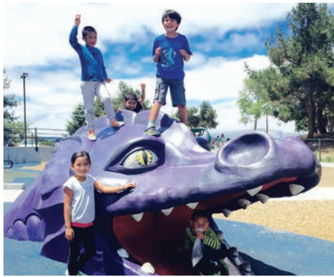
Children enjoying a fun-filled day at Coyote Point Park's Magic Mountain Playground.

County libraries are at the heart of connecting families to their communities. Libraries offer many activities that bring parents and children together to learn, play, be creative and interact with other members of the community.