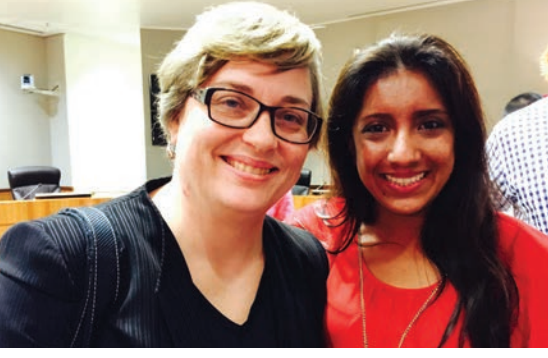
SUPPORTED TRAINING AND EMPLOYMENT PROGRAM (STEP)

STEP provides internships and employment skills training in County departments for current, nonminor dependents, and young people who have aged out of foster care. Interns gain hands-on experience working in a professional setting, get personal guidance from a mentor, gain academic credit and/or transcript notations, and build a professional resume. It is a partnership between the Human Resources Department and the Human Services Agency.