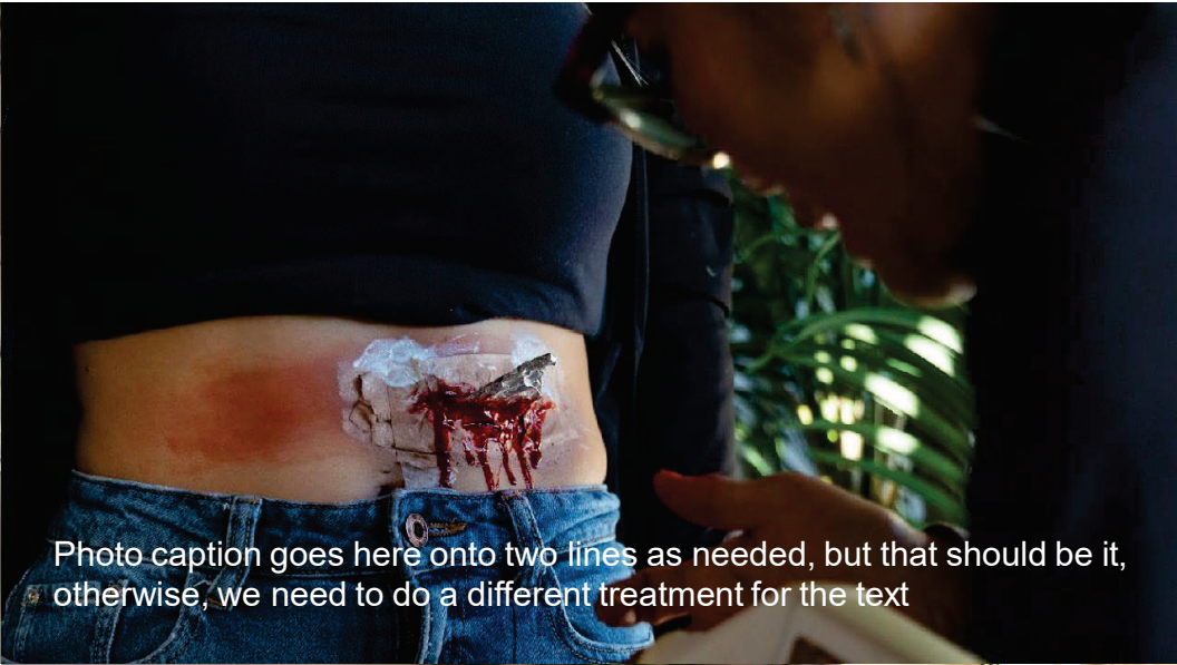
Photo caption goes here onto two lines as needed, but that should be it, otherwise, we need to do a different treatment for the text