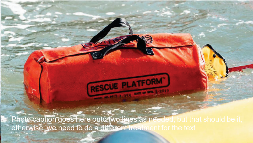
Photo caption goes here onto two lines as needed, but that should be it, otherwise, we need to do a different treatment for the text