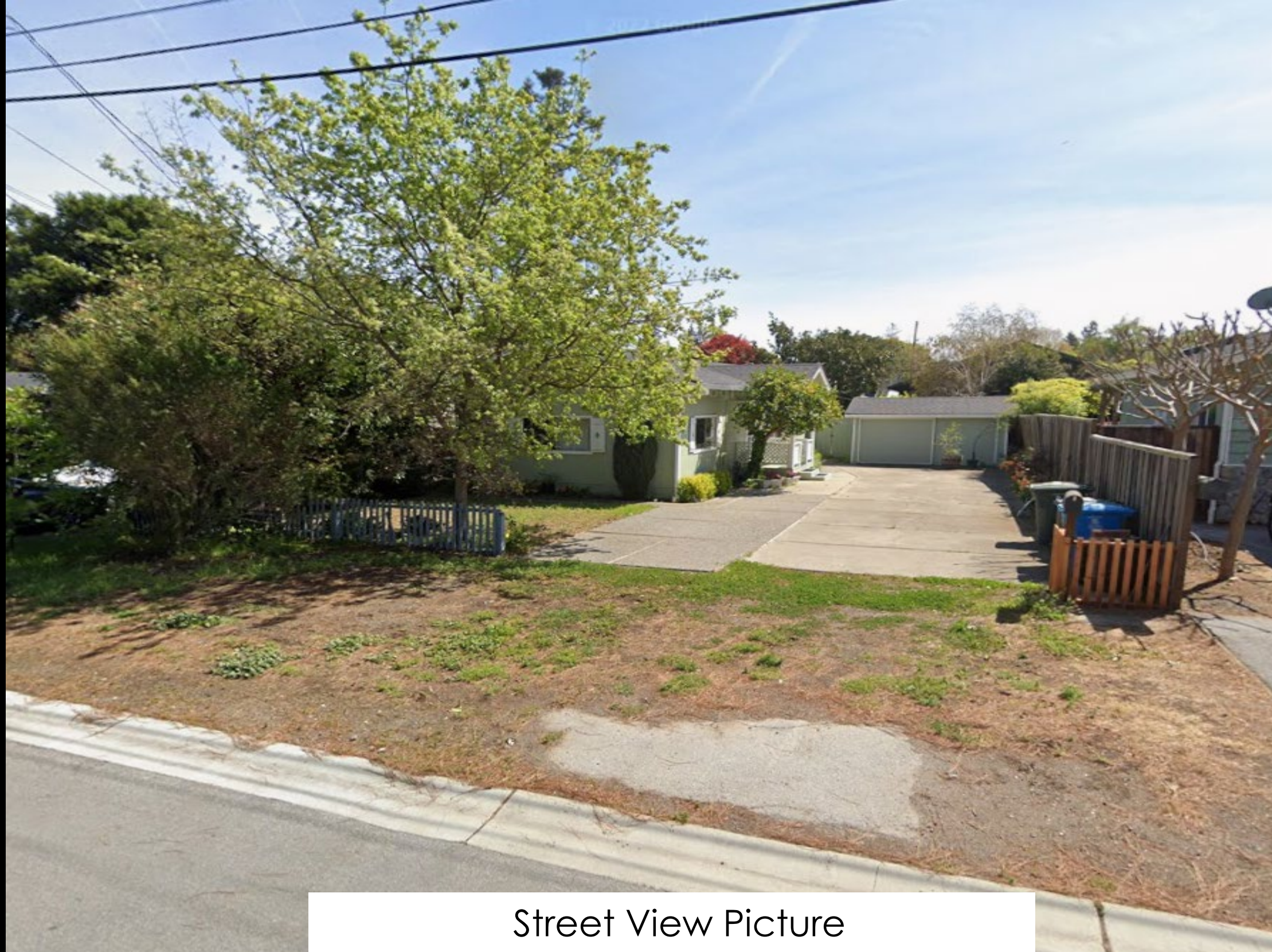
Street View Picture