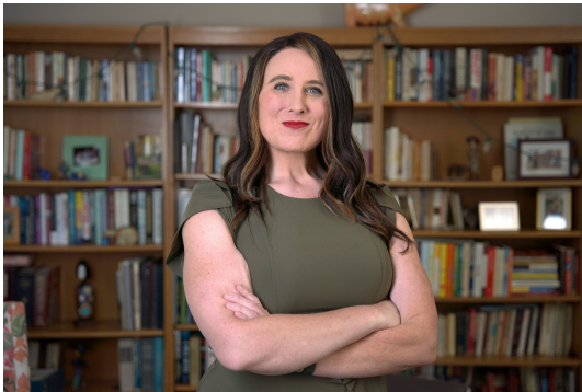
Star of audio reality show 'Being: Trans'