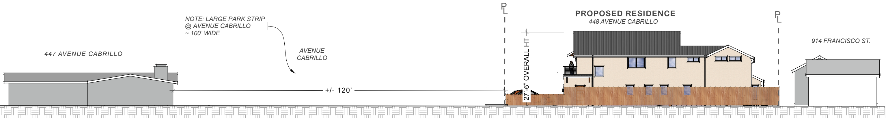
4 EXTERIOR ELEVATION - WEST scale: 1/20=1'-0"

NOTE: LARGE PARK STRIP @ AVENUE CABRILLO ~ 100' WIDE