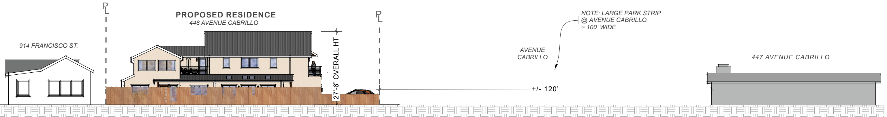
3 EXTERIOR ELEVATION - EAST scale: 1:20=1'-0"

NOTE: LARGE PARK STRIP @ AVENUE CABRILLO ~ 100' WIDE