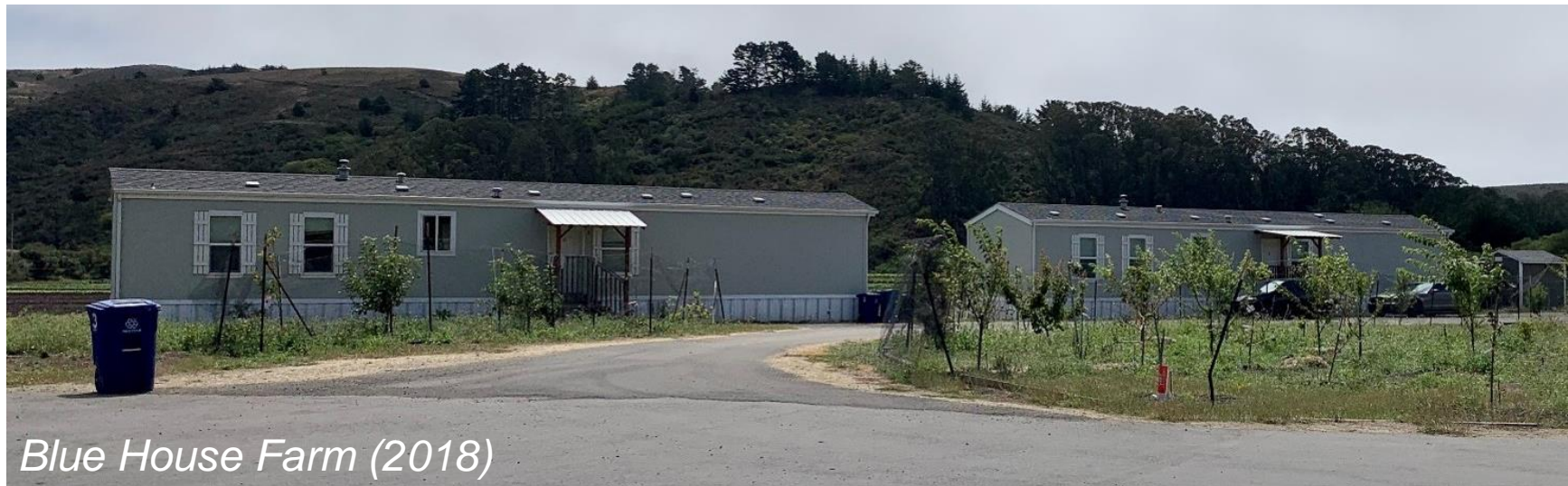
Blue House Farm (2018)