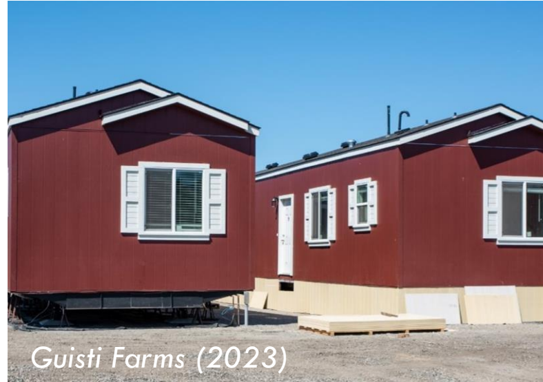
Guisti Farms (2023)