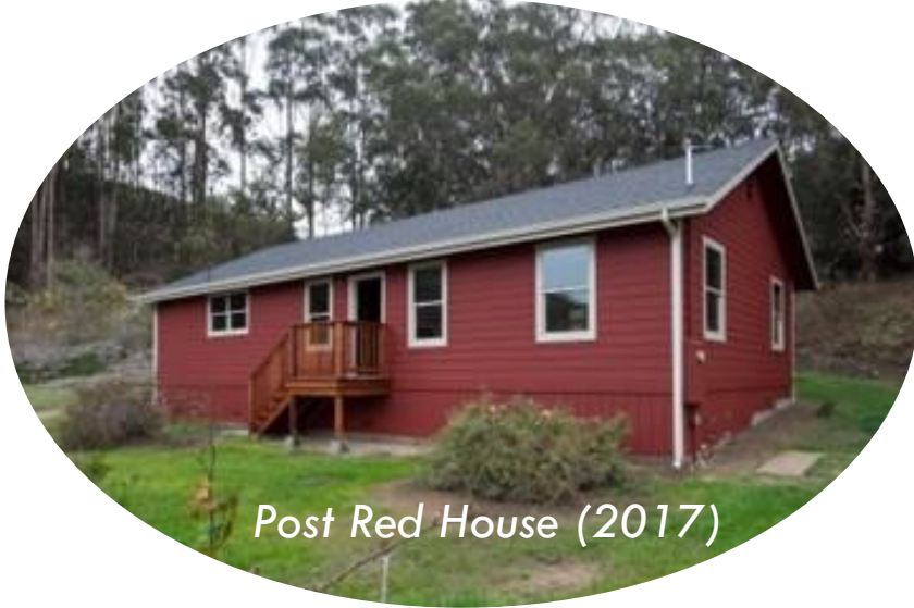
Post Red House (2017)