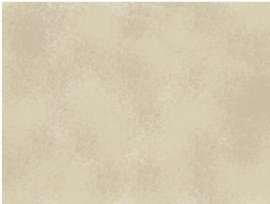
EXT. CEMENT PLASTER: STUCCO SUPPLY, SAN JOSE; COLOR T90 AMBER FROST