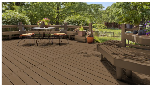
EXT. CEDAR SIDING: BEHR SOLID COLOR STAIN - "WRANGLER BROWN"