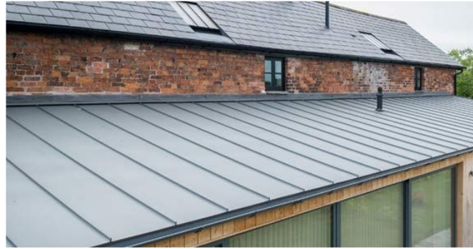
BERRIDGE STANDING SEAM METAL ROOF - ZINC GREY