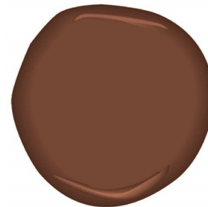
KOLBE METAL CLAD WINDOWS: NUTMEG COLOR