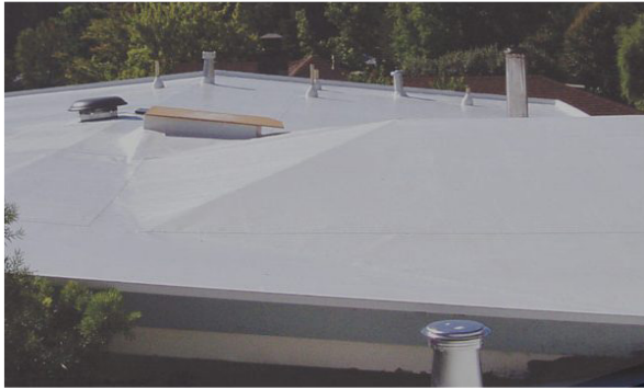
FLAT ROOF - GAF TPO MEMBRANE - GRAY