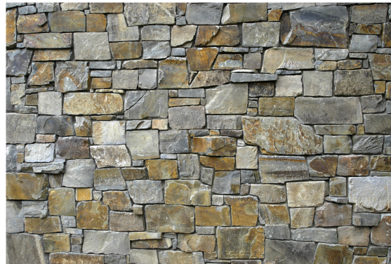
EXT. VENEER STONE: CHIEF CLIFF