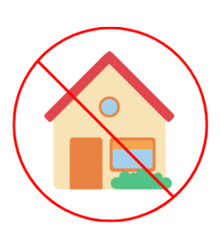
Unhoused community members