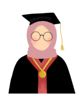
College students juggling tuition and housing costs