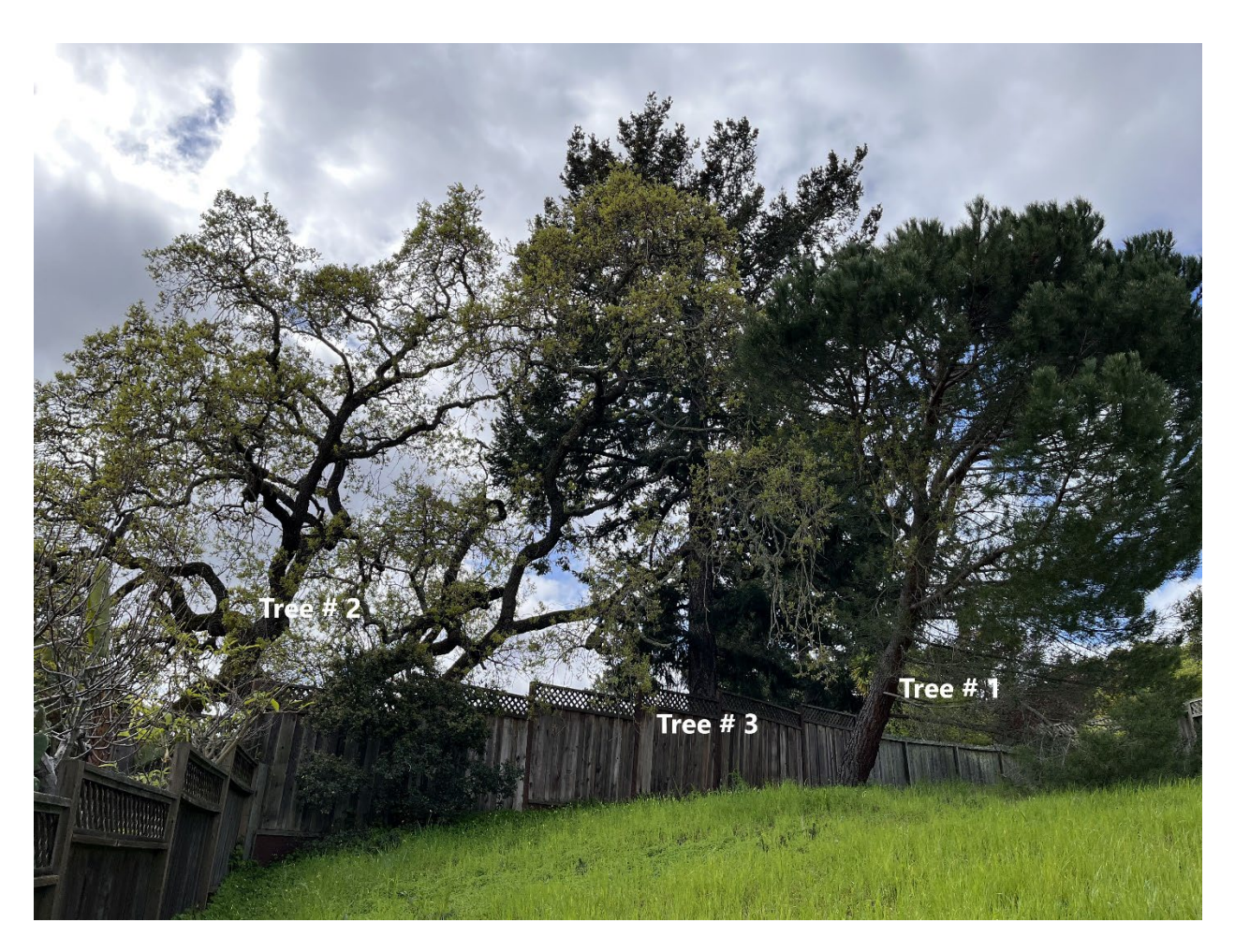
Tree #s 1, 2 and 3