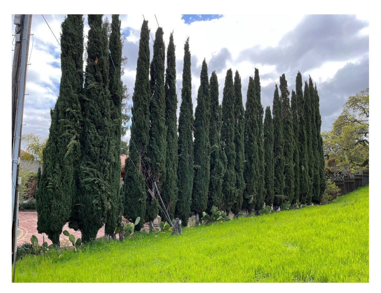
<u>Tree #s 4</u>

0 Lakemead Way, Emerald Hills March 28, 2023