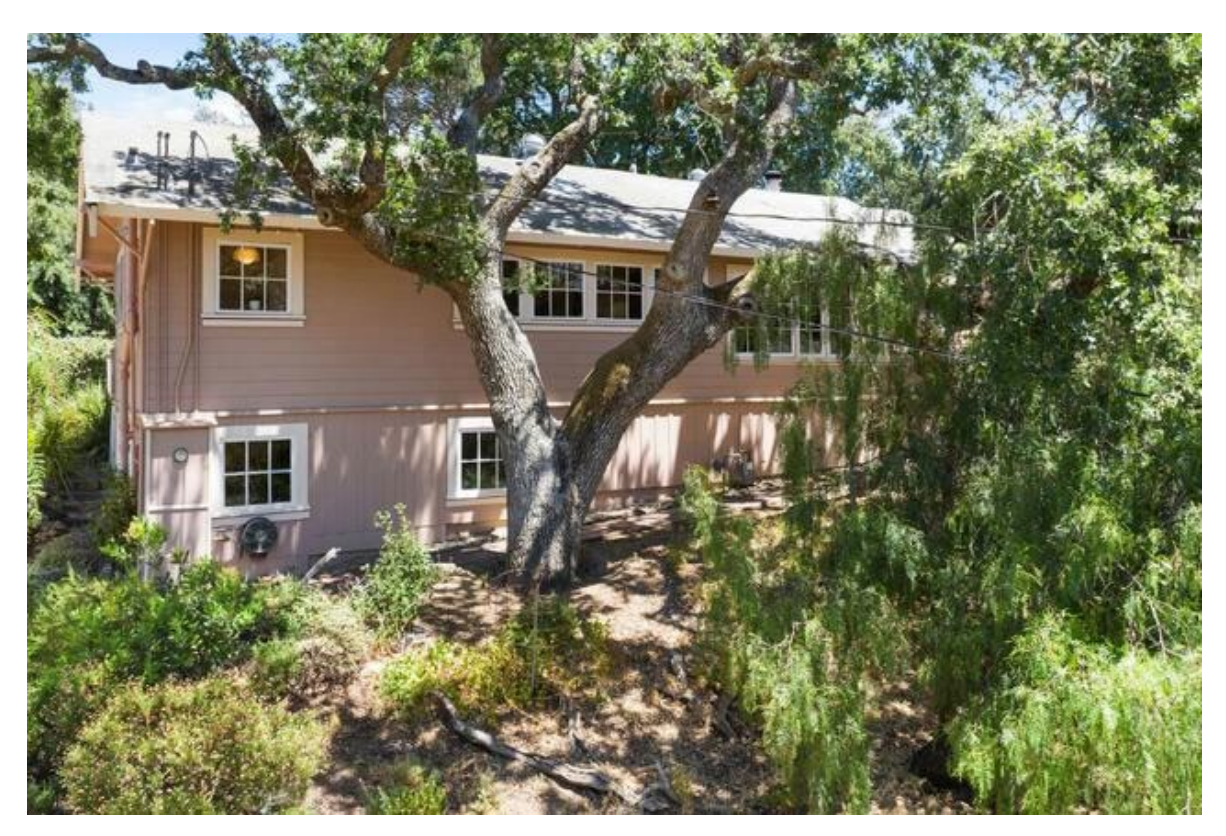
Photograph 2 890 Upton Road View: Side Façade