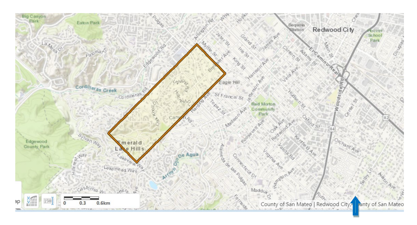
Figure # 1 Subdivision Map of Oak Knoll Manor within the Emerald Hills area.