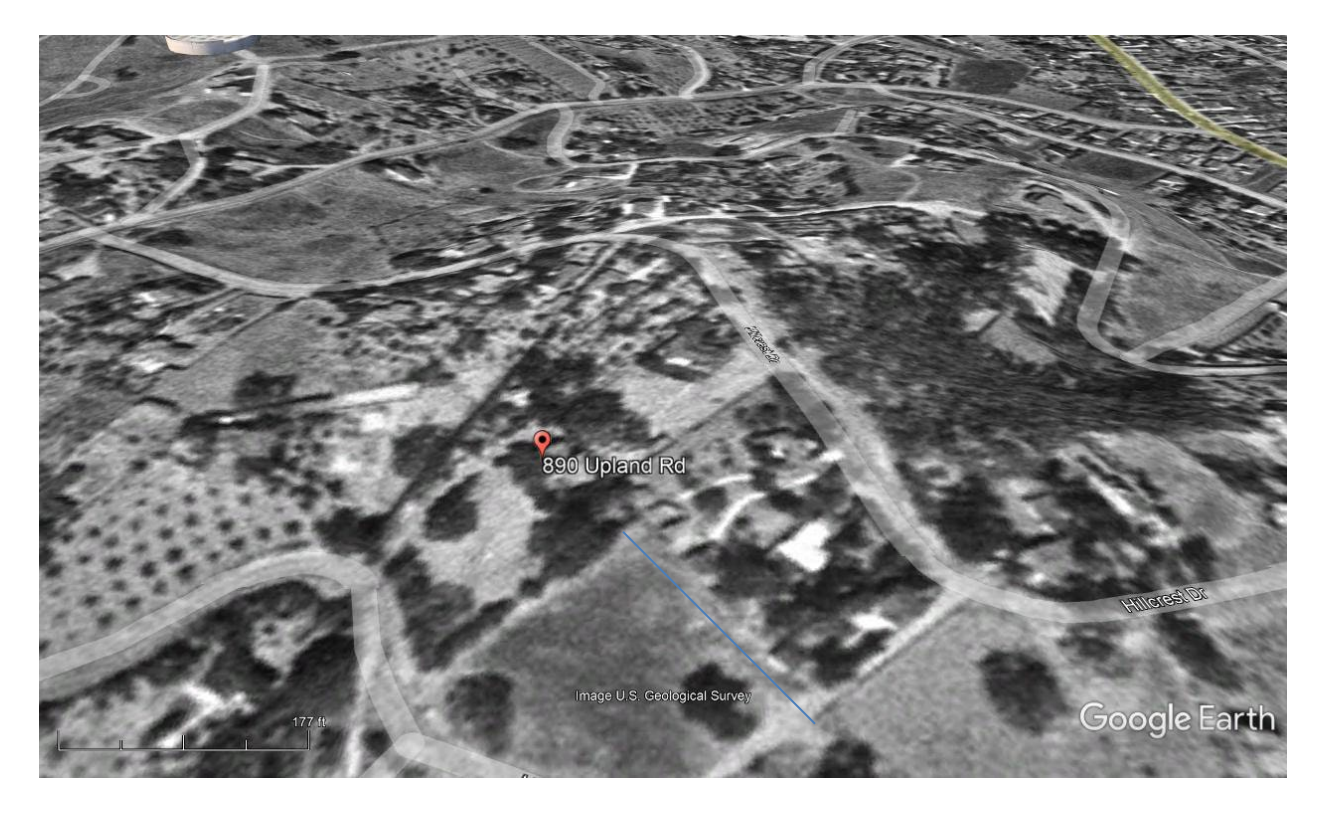
Figure 3 Historic aerial view of the area in 1947.