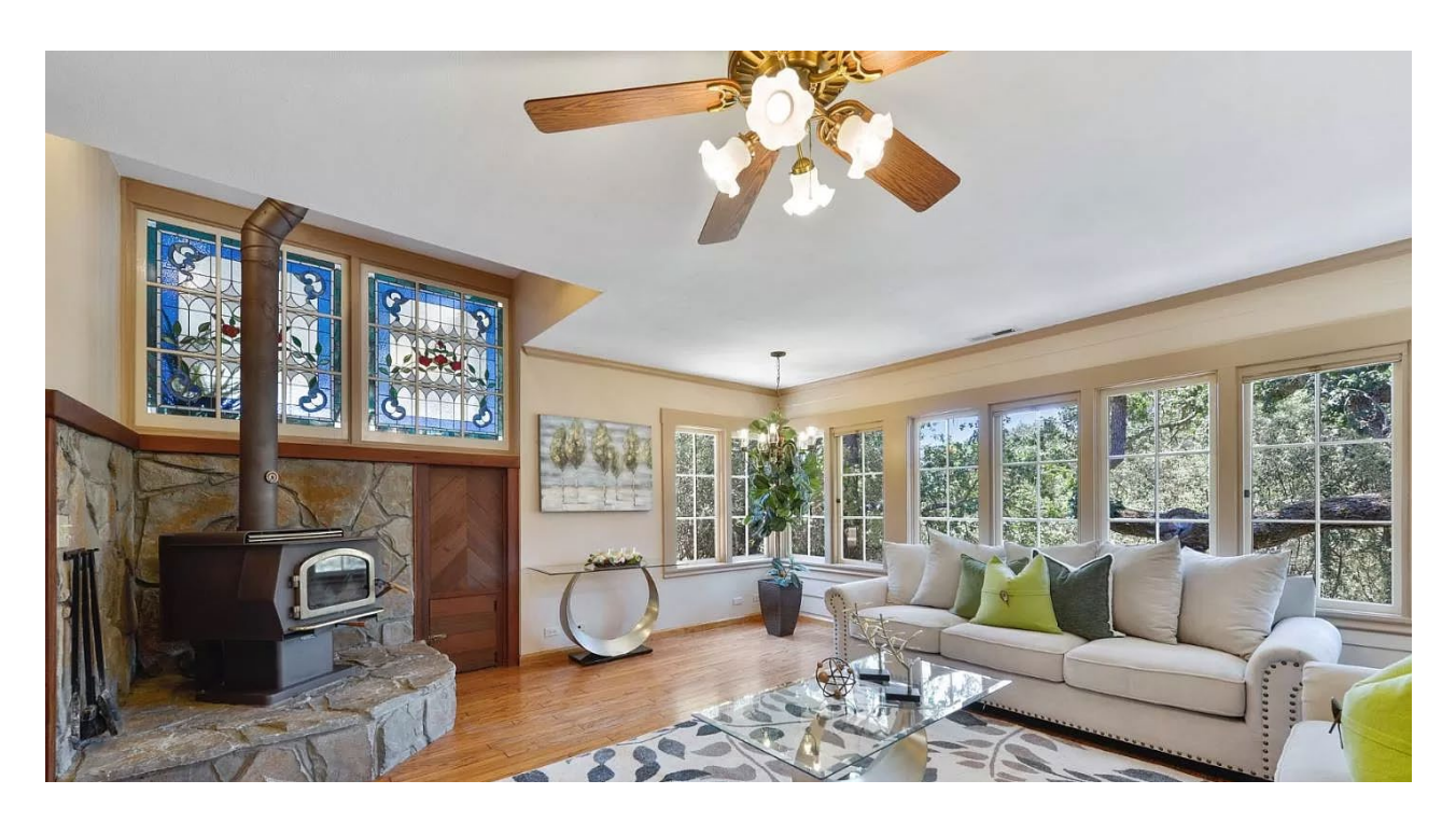
Photograph 3 890 Upton Road. The living room shows the remodeling and inclusion of paired art glass windows, stone behind the wood stove and on the floor to raise the stove.