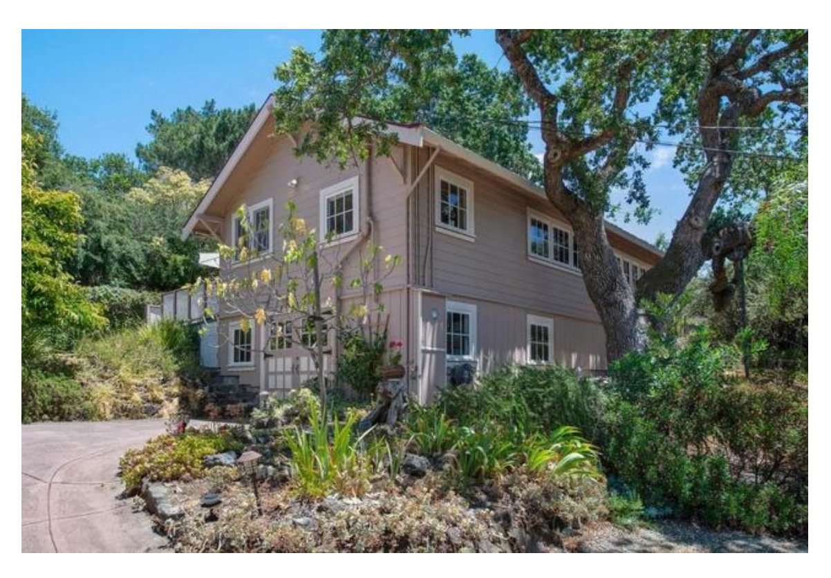
Photograph 1 890 Upton Road View: Front end of the building facing the street and side façade. This appears to be the older section.