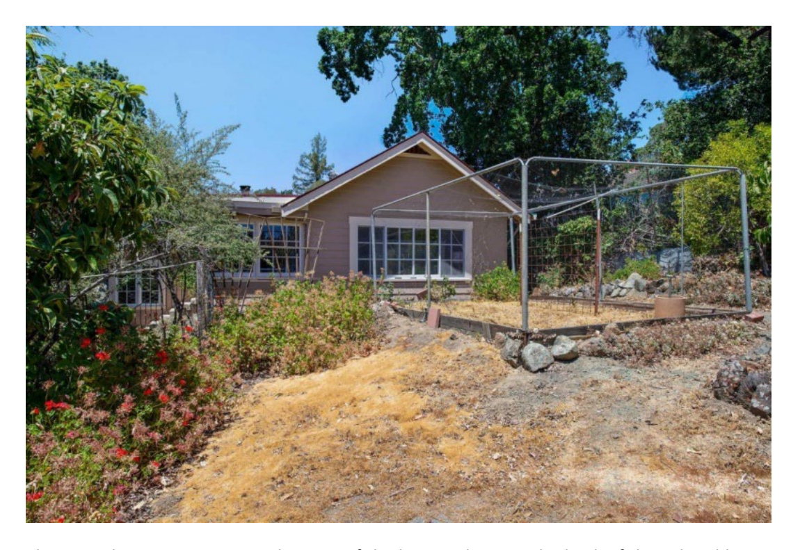
Photograph 7 890 Upton Road – Rear of the house, showing the back of the side addition.

In summary, the building is in good condition and has been extensively altered by the addition of non-original materials, replacing the windows with art glass from a different period as well as various other modifications that have changed the character of the original design.