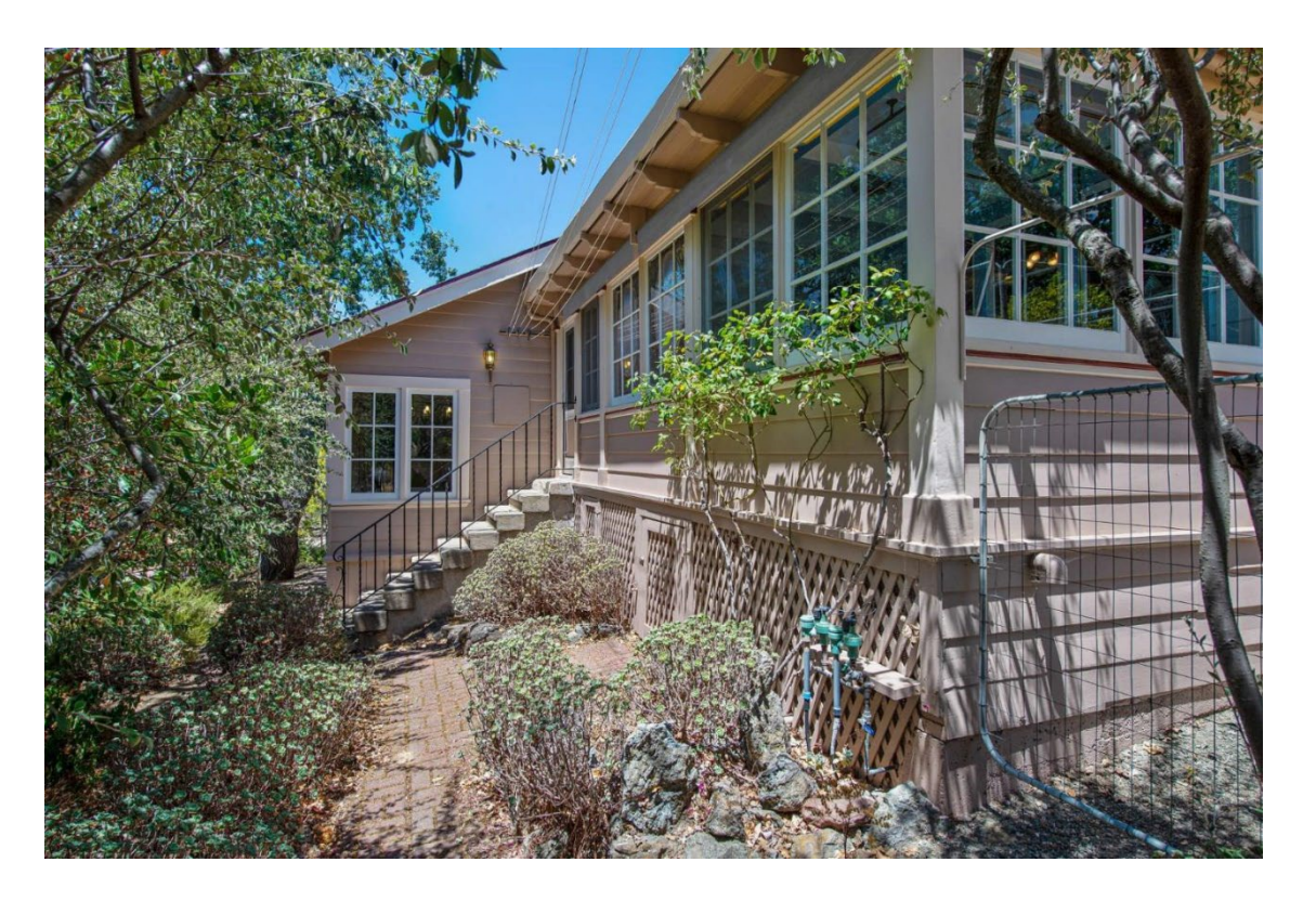
Photograph 5 890 Upton Road - Rear and side of the building, showing the elevation change in the two sections.