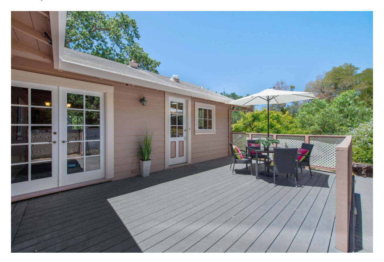
Photograph 4 890 Upton Road New raised Side deck and remodeled side of the house.