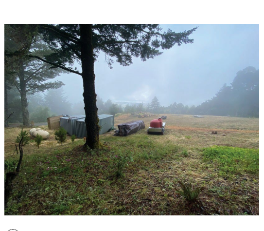
1 Site Overview to the west.