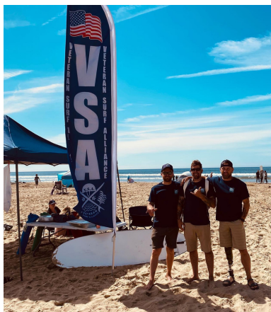
Enterprise of the Year Veteran Surf Alliance