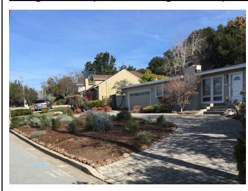
Image 3: Photo of residence on the east side of Parrott Drive, across from proposed parcels

Image 2: Map of existing development along Parrott Drive with approximate proposed lot lines