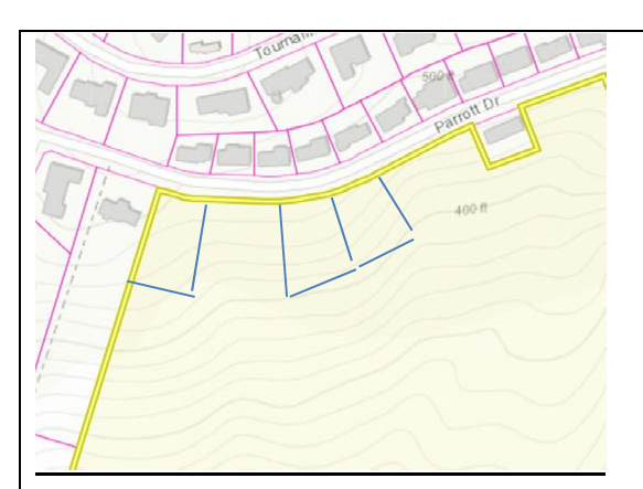
Image 2: Map of existing development along Parrott Drive with approximate proposed lot lines