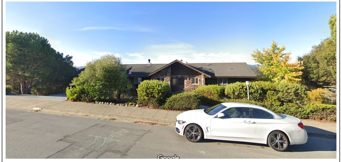
Image 4: Photo of the west side of Parrott Drive, to the south of the parcels

Image 3: Photo of residence on the east side of Parrott Drive, across from proposed parcels