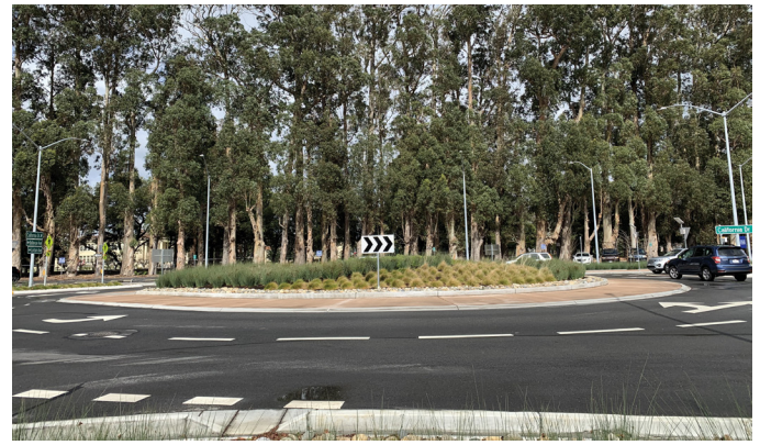
Example of roundabout in Burlingame, CA