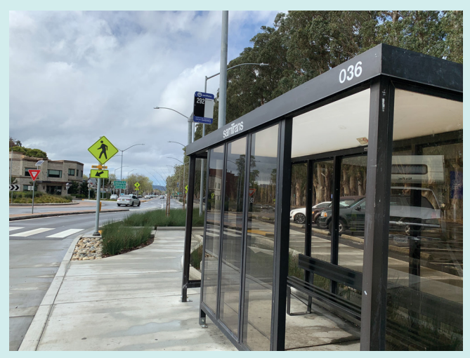
Bus Stop Shelter