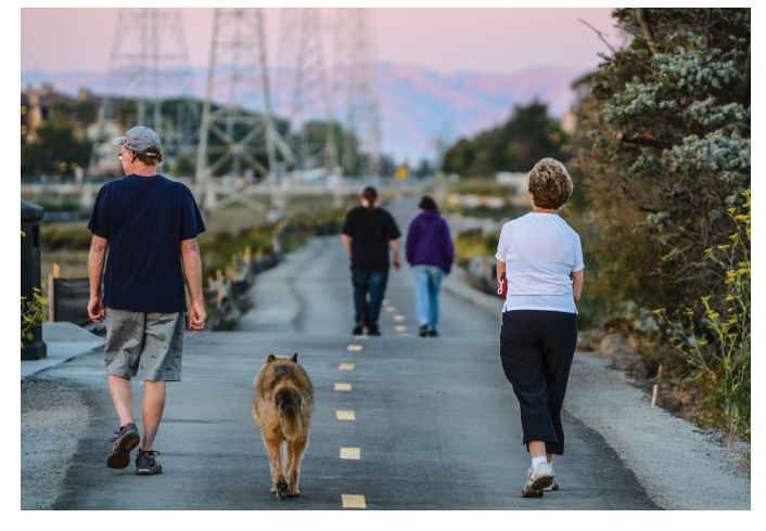
Example of a multimodal trail