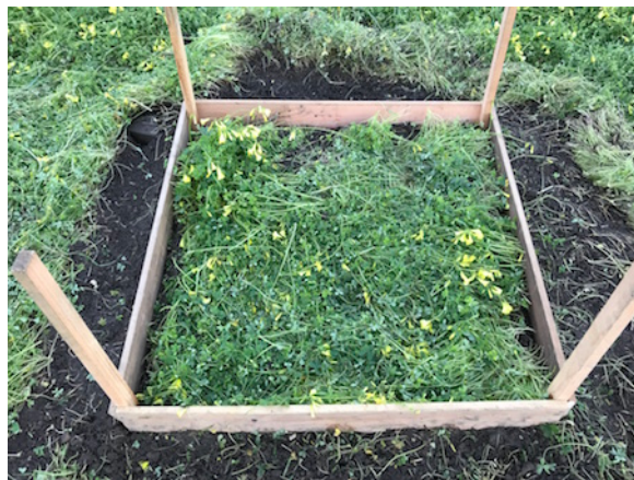
Plot 7, March 2019

The Control plot is meant to provide a basis for comparison to "no treatment". This area was left undisturbed, and monitored through the year to document the uninterrupted life cycle of Oxalis and other plants within this habitat. No change in density or cover of Oxalis was noted in the plot.