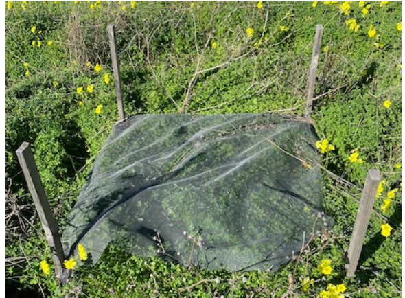
Plot 5, February 2020