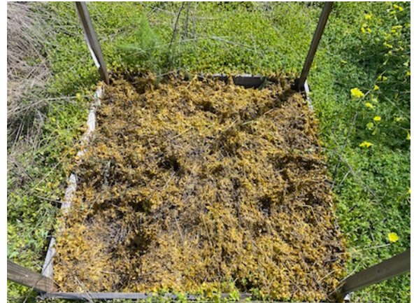
Plot 3, retreated, March 2020