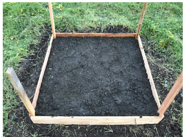
Plot 5 after burying/compaction, March 2019

In Plot 5, the Oxalis was covered with 4+ inches of a mix of soil and gravel base-rock, and then compacted down to 3" thick. The vegetation was stomped down flat first to eliminate any stems from protruding into the cover material. The plot was covered with fine screening to prevent any outside weed seed from blowing in and limit the regrowth to the corms remaining in the ground.