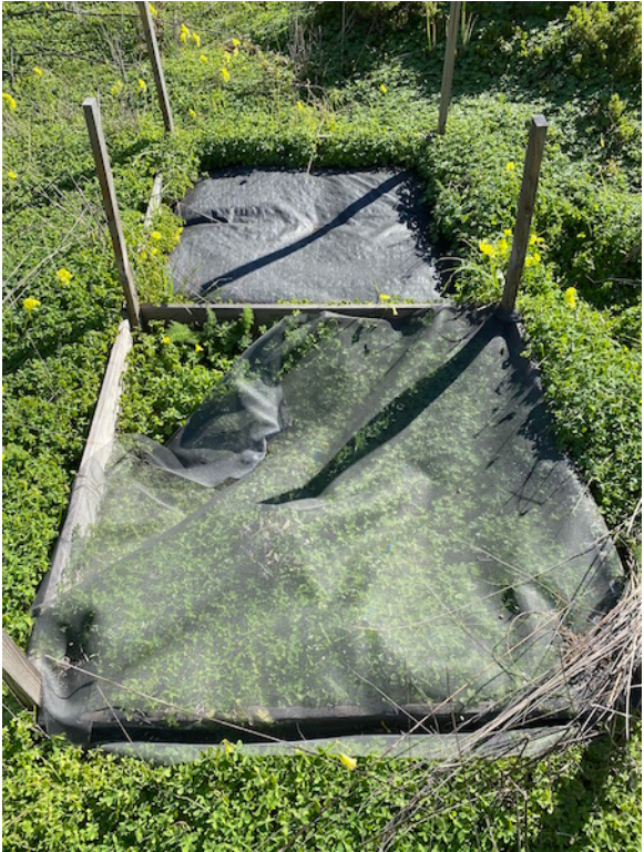
Plots 1 (top) and 2, February 2020