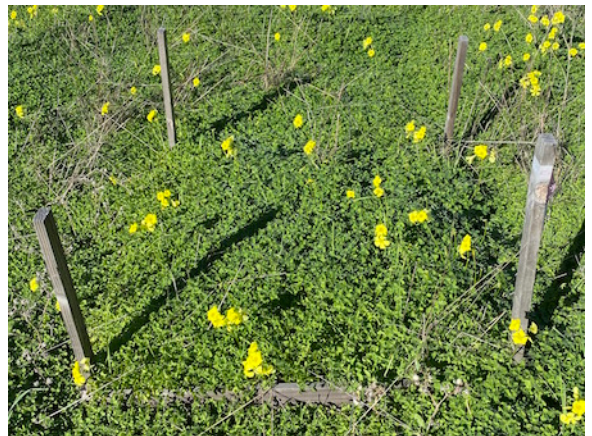
Plot 7, February 2020