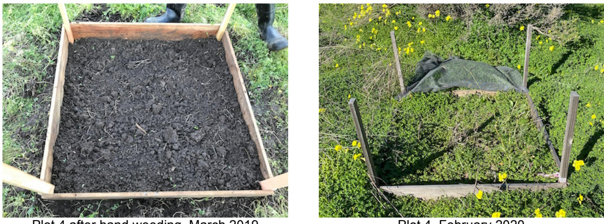
Plot 4 after hand weeding, March 2019

This plot was weeded by hand, using hand picks and cultivators to remove as much of the plant, root and corms as reasonably possible in about 10 minutes time. This is a labor-intensive approach, and difficult to really clean out all the plant materials short of sifting the soil, but will give a guide to the effectiveness of this approach. As a side note, at that rate of work, it would take approx. 806 person-hours (100+ 8-hour days) to clear an acre of heavy oxalis infestation.