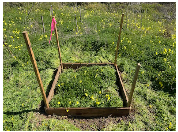
Plot 8 before treatment

http://www.andaman-ag.com/products/weed-slayer-organic-herbicide/