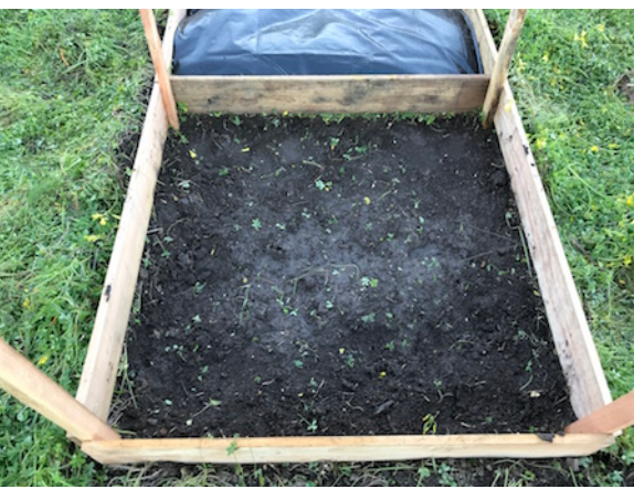
Plot 2, 3" soil removal, March 2019

As expected, corms in the soil in Plot 1 (and in the tarp-wrapped removed soil from Plot 2) attempted to grow, extending radicles to the surface but, blocked by the tarp and with no sunlight, development of cotyledon was inhibited. Tarp was replaced to maintain barrier and see if new corms develop in the following year.