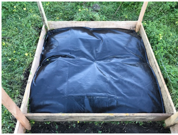
Plot 1, tarped, March, 2019

The area of Plot 2 has had its top 3" inches of soil removed and stockpiled under a tarp to the side. The plot has been covered with a fine mesh window screen to minimize any introduction of windblown seed from other plants.