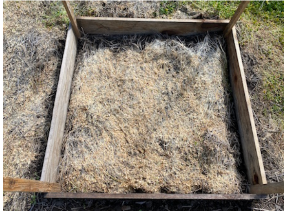
Plot 8, ten days after Weed Slayer application