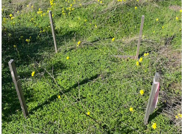
Plot 3, February 2020

If the treated vegetation dries up and dissolves completely, this plot will be screened over to limit any new growth to only the corms remaining in the ground.