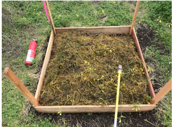
Plot 3 after flaming, March 2019

The Oxalis in Plot 3 was treated with a propane torch to heat the plants to the point of wilting and browning, but not fully burning. A metal shield was used to keep the wood frame and other nearby plants from being affected.