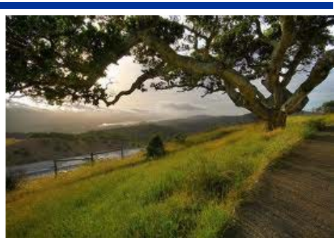
July 31, 2016

PFM Asset Management LLC 50 California Street, Suite 2300 San Francisco, CA 94111 415-982-5544 www.pfm.com