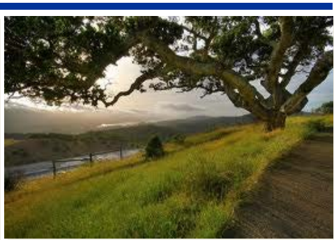
February 28, 2017

PFM Asset Management LLC 50 California Street, Suite 2300