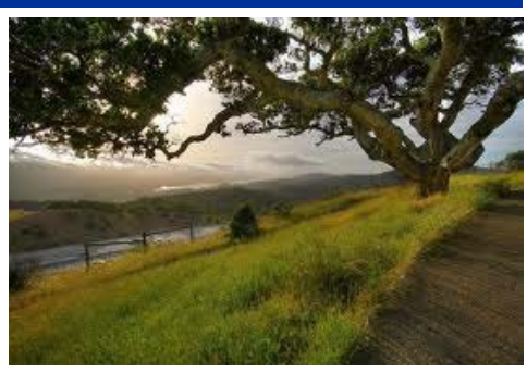
May 31, 2018

PFM Asset Management LLC 50 California Street, Suite 2300 San Francisco, CA 94111 415-982-5544 www.pfm.com