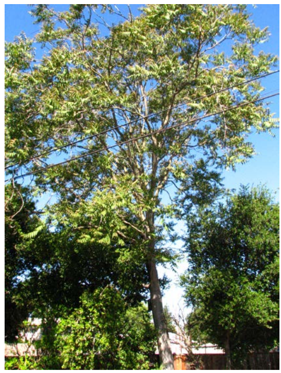
R to L 10, 11, 12

North view of oaks 10, 11, 12, 13, & 14 extend -ed south and west into the (e) lot.